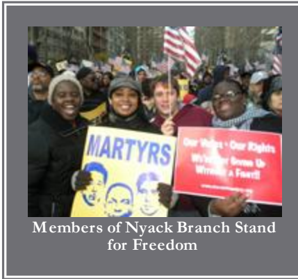
Members of Nyack Branch Stand for Freedom